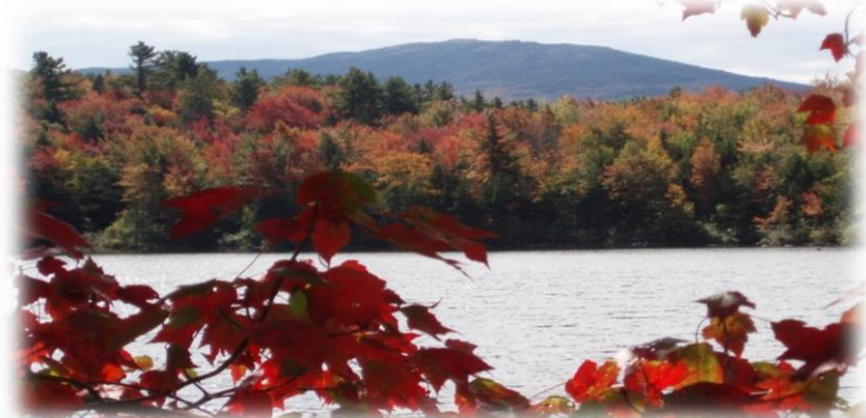
Christie Faro, DES