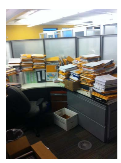
EPA Region 7 Annual Biosolids Reports