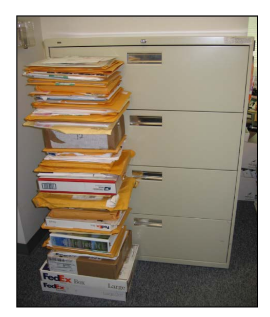
EPA Region 9 Annual Pretreatment Reports